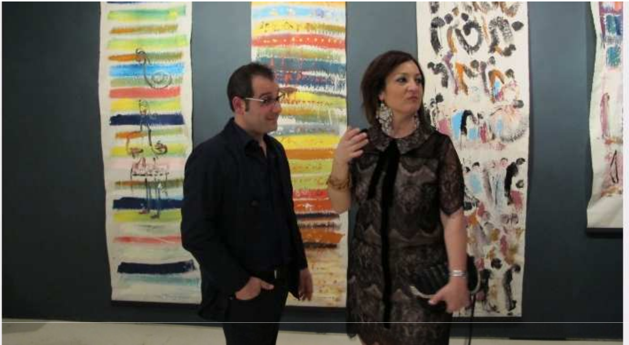
"From Rome to New York: Signs, Lines and Shapes"