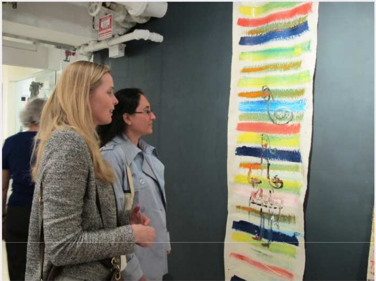
"From Rome to New York: Signs, Lines and Shapes"