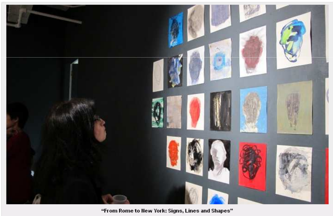
"From Rome to New York: Signs, Lines and Shapes"